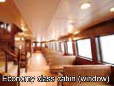
Economy class cabin (window)

The relaxing first class cabin on the 2nd floor provides an amazing view.