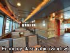
Economy class cabin (window)