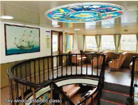
Sky window (stained glass)