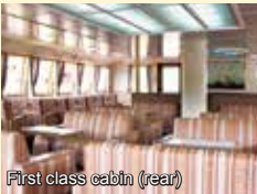
First class cabin (rear)