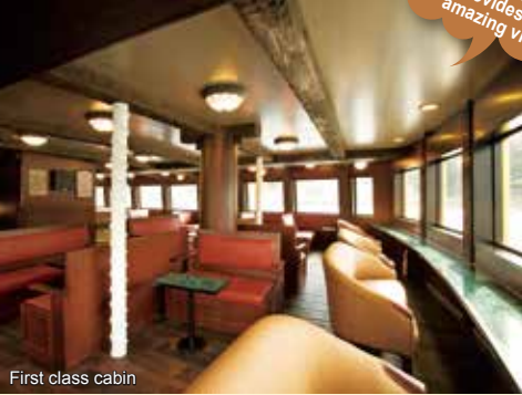
First class cabin