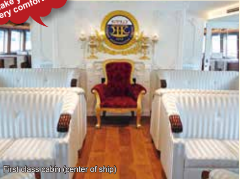
First class cabin (center of ship)

Soft sofas of first class cabin make your cruise very comfortable!