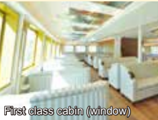
First class cabin (window)

The relaxing first class cabin on the 2nd floor provides an amazing view.